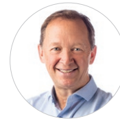
EY Entrepreneur Of The Year™ (Canada, 2018)

“Our strong history of innovation as well as the unwavering commitment and foresight of our global team are uniquely positioning EXFO as the trusted advisor that customers can count on for their network transformations.”